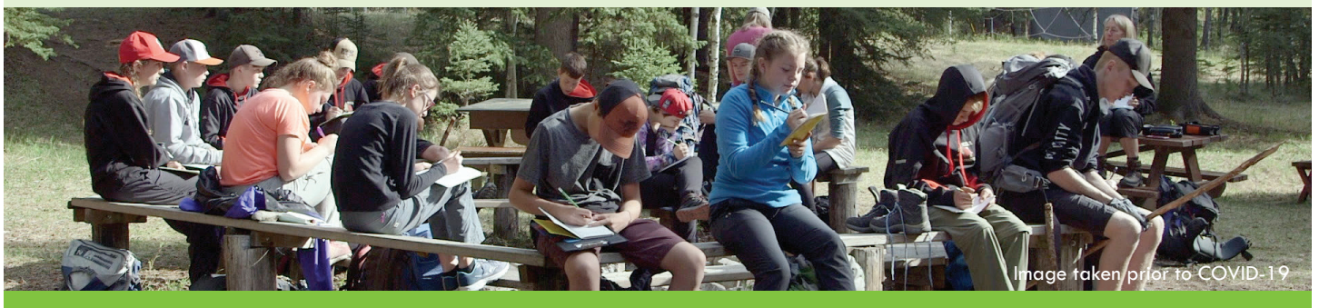
Image taken prior to COVID-19

Additional local measures will be added for the 2020/21 school year including the voices of student, parent and staff through satisfaction survey results.