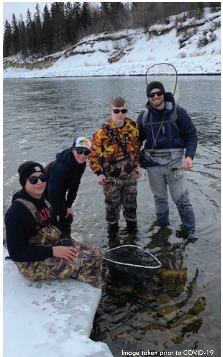
Image taken prior to COVID-19