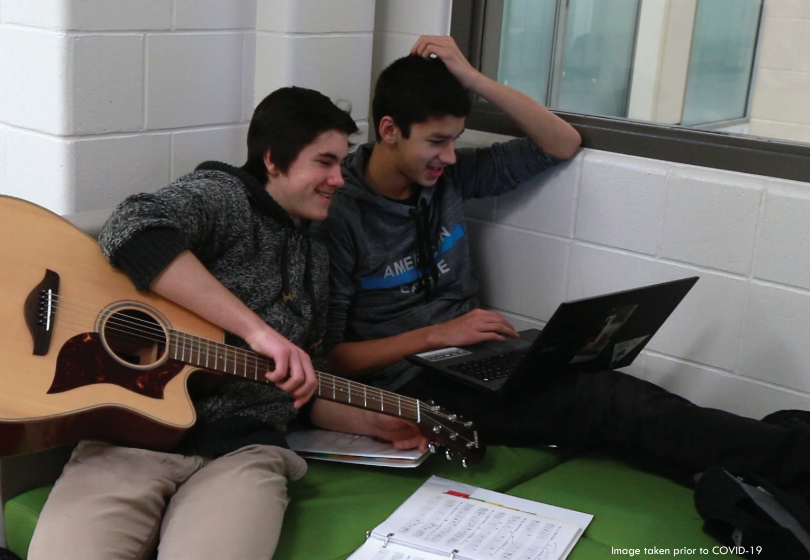
Image taken prior to COVID-19