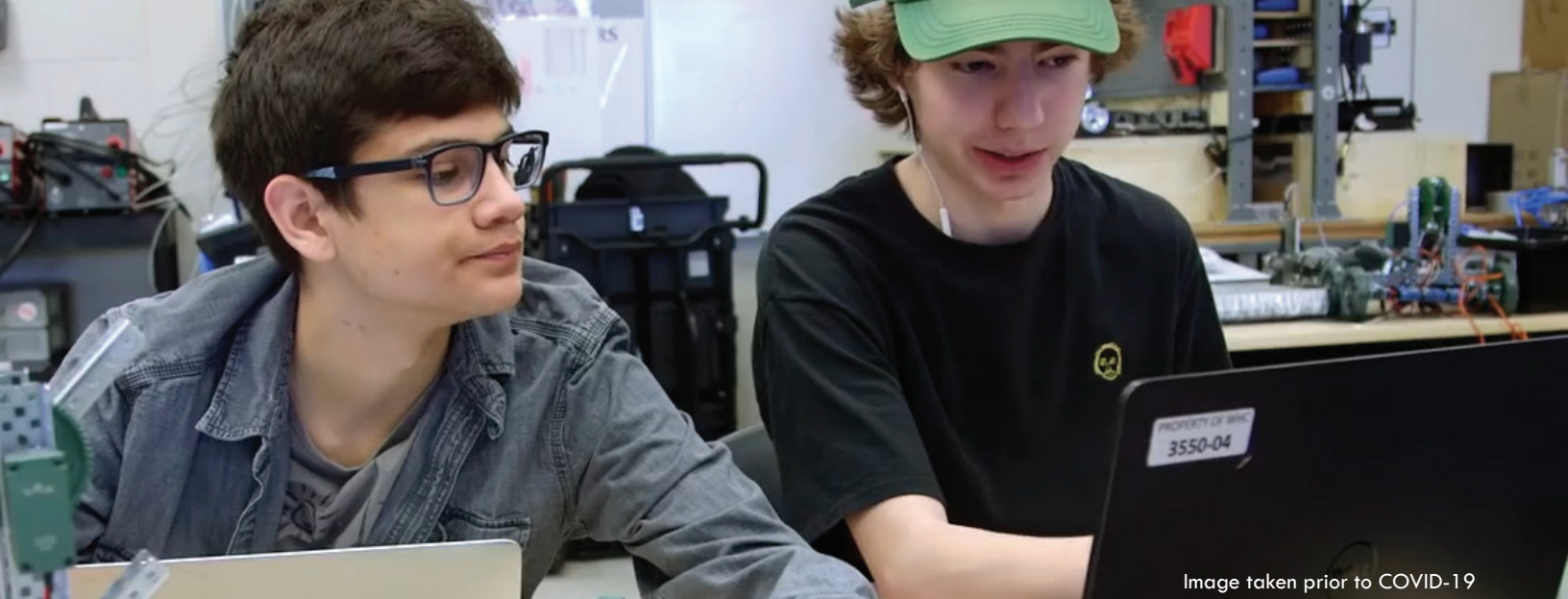
Image taken prior to COVID-19