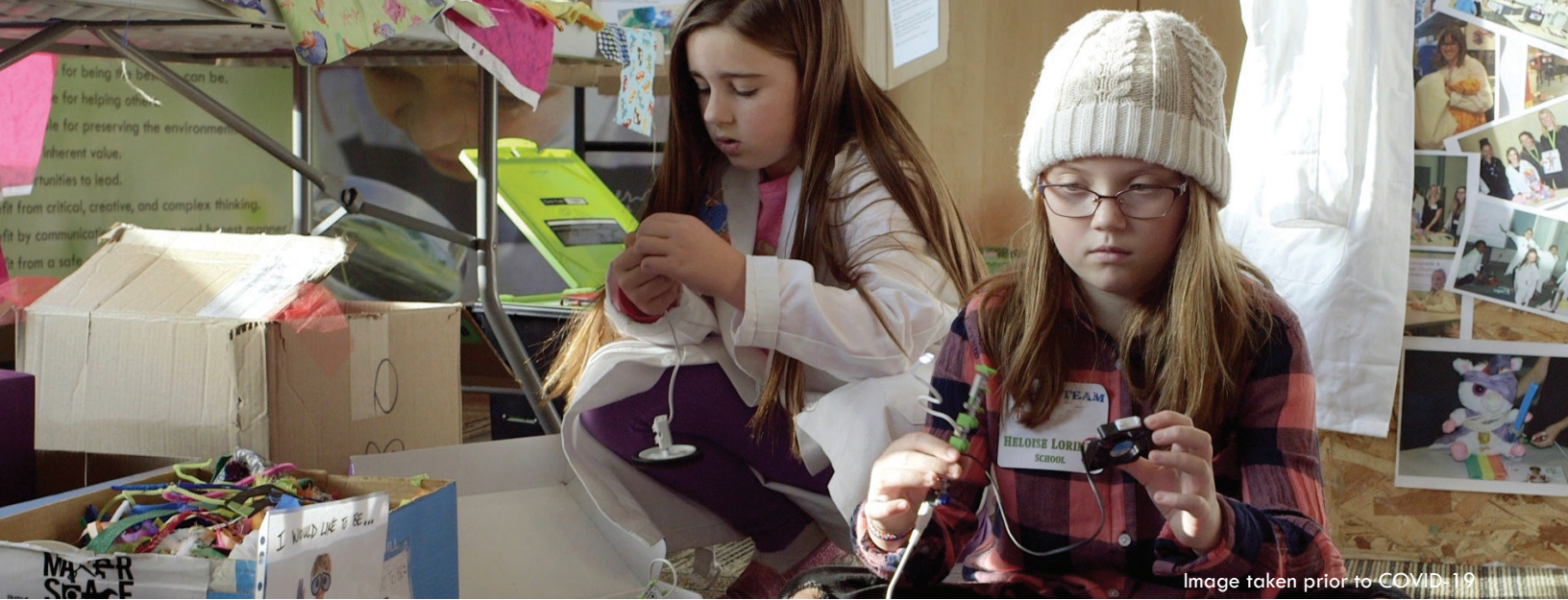
Image taken prior to COVID-19