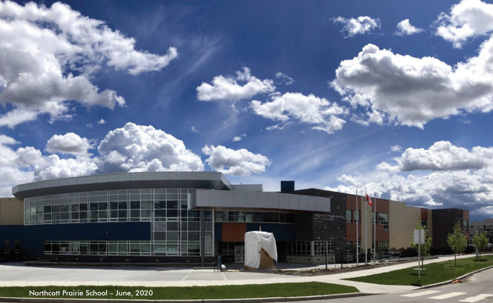
Northcott Prairie School – June, 2020