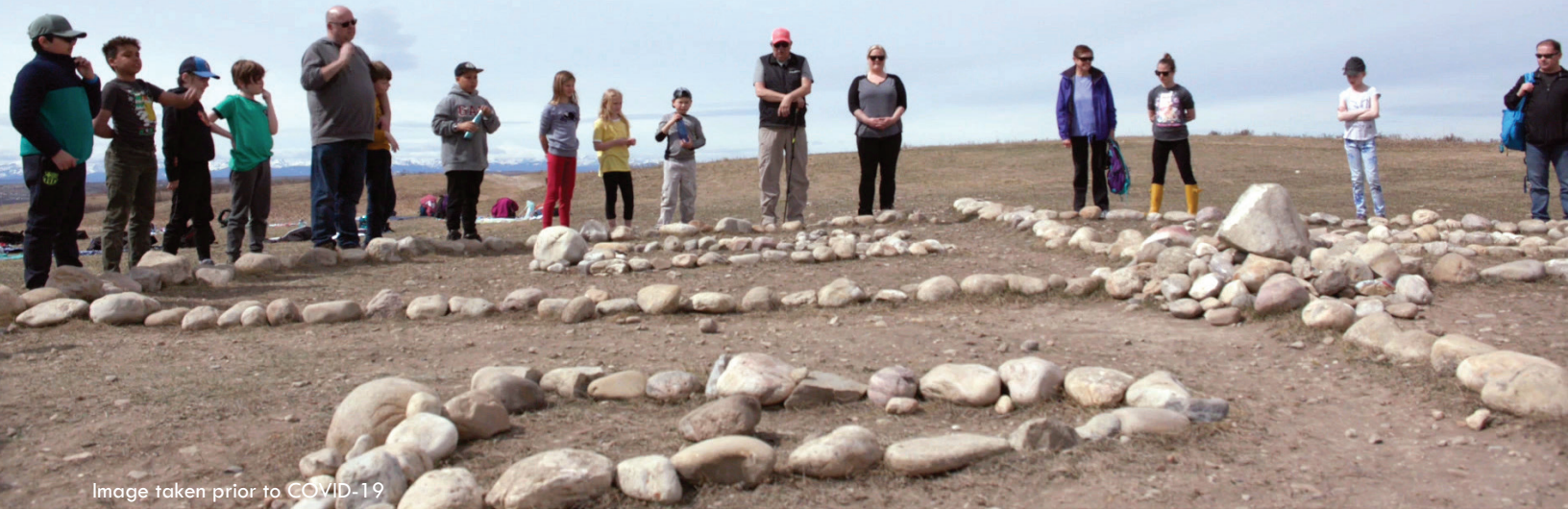
Image taken prior to COVID-19