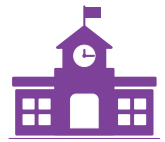
NEED FOR SCHOOLS